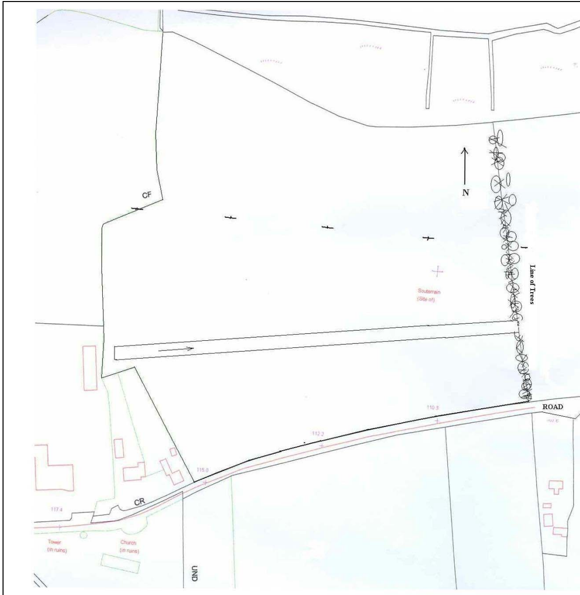
The site location from a 1/2500 Co. Council Map of the area.